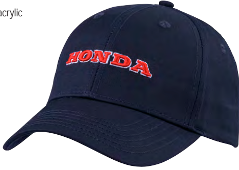
TOKYO DENIM 233-7020060-02