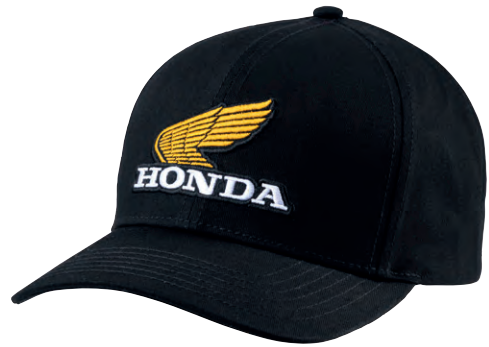
VINTAGE BLACK 243-7020060-11