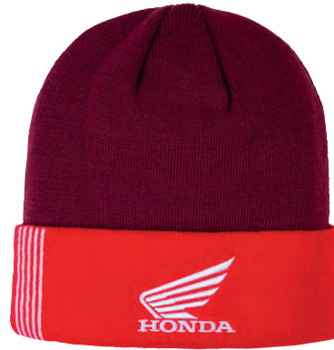
RED RACING 243-0506042-01