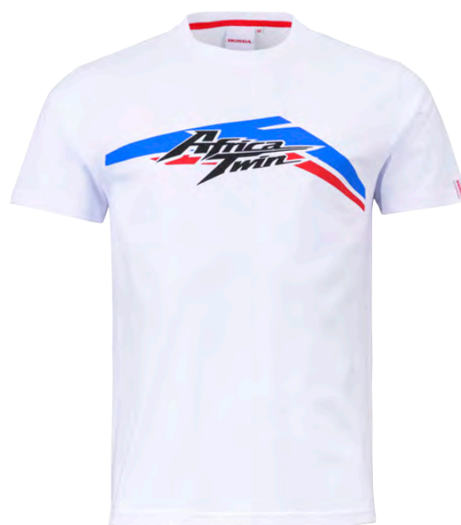
AFRICA TWIN WHITE 233-8820040-00