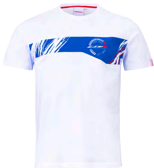
CBR 30 TH 233-8820040-30