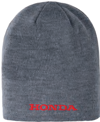
CORPO REVERSIBLE 243-0506042-03