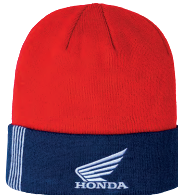
NAVY RED RACING 243-0506042-20