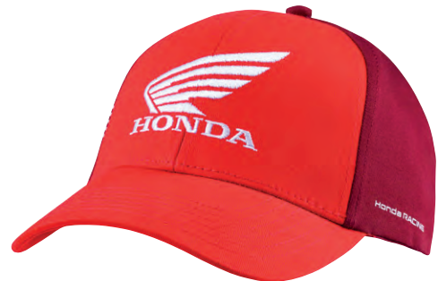
RACING RED 243-7020060-01