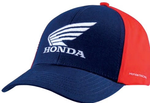
RACING NAVY 243-7020060-02